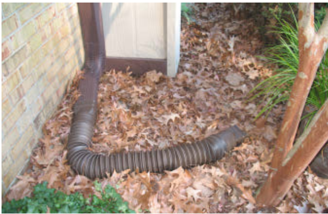
Figure 2. Example of a downspout with a flexible extension pipe. Direct the runoff 10 feet away from the foundation and into the landscape.

Rooftop redirection usually does not require a professional to install. Measure the end of the downspout and the distance you want to direct the runoff so you can purchase the correct size fittings and amount of extension pipe. The extension pipe can have holes in it to allow the stormwater to seep out along the length as well as the end of the pipe, or it can be solid so the water exits only at the end. If the stormwater is being directed into a lawn area, consider a hinged or flexible extension pipe that can easily be moved out of the way if necessary when mowing.